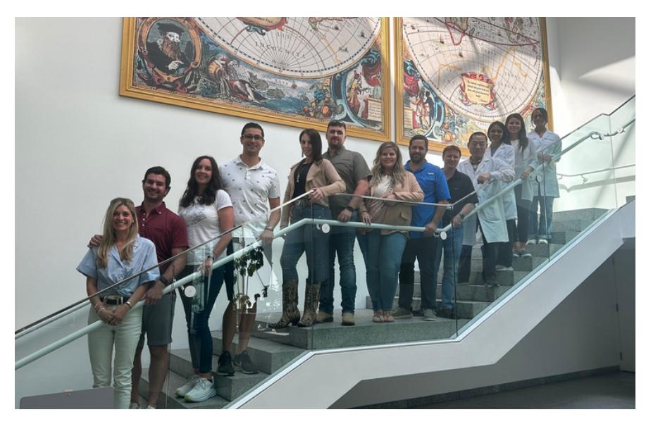
Hope for PDCD Board Site Visit to UTSW, June 2023

Focus Areas: Fundraising, Social Media, Education, and Advocacy